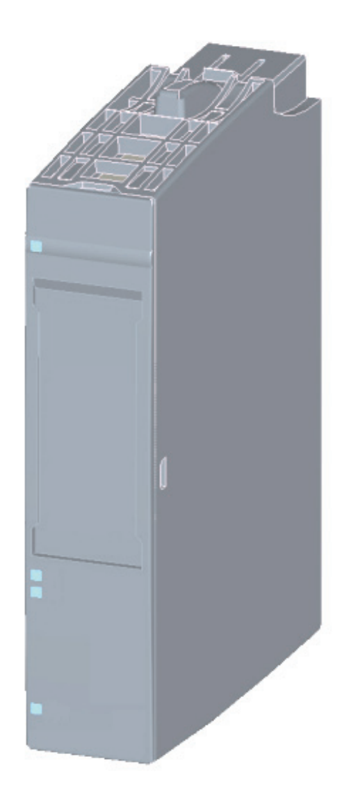
Figure 2-1 View of CM PtP (without BaseUnit)